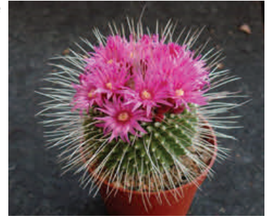
Mammillaria spinosissima "Un Poco"

Mammillaria is quite possibly the most popular genus of cacti, and is usually one of the first succulents a person buys. There are several reasons for this. With nearly 200 species, Mammillaria is one of the larger genera in the Cactaceae, which means there is an enormous amount of variety to choose from. Some species are fingernail size, others solitary globular plants, some are straight spined, some form sizeable clumps, while others are heavily spined with hooks. The more common species are ubiquitous at any nursery, big box store, or even supermarket that sells plants. Most species are small, easy to grow, and have a "cute" factor that make even non-gardeners want to buy one for their patio or windowsill. The most commonly grown species are also quite tolerant of abuse and neglect.