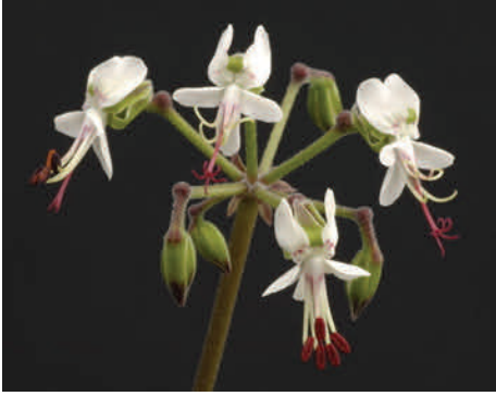
Flowers of Pelargonium laxum

On any street, anywhere in the country, you will find numerous homes growing Pelargonium hybrids in their flower beds. In cold weather regions they are annuals but in climates like ours they will live forever with good care. They are popular for their showy flowers that come in a vast array of colors too numerous to list. Most non-experts incorrectly call these plants Geranium . They aren't too far off as both belong to the family Geraniaceae, but true Geranium species are usually weeds. What few people realize is that there are a large group of true species Pelargonium (not hybrids) that are winter-growing succulents well suited for cultivation in California. These are the plants that our succulent of the month is focused upon.