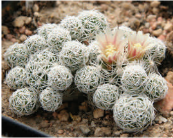
Mammillaria vetula ssp. gracilis

Mammillaria ranges from Columbia all the way to Canada. Approximately ten species are found in the southwestern portion of the United States, including California. However, the true heart of Mammillaria diversity is Mexico. Most species occur there and you can see the full range of variation the genus has to offer. While some species are extremely hardy (particularly the North American species), others are more frost sensitive. Almost all Mammillaria will do just fine in Southern California, with little or no winter protection, as long as they are potted in a freely draining potting mix. If you live in areas that get hard frost in the winter (e.g. the Antelope Valley) be sure to check the frost tolerance of your species.