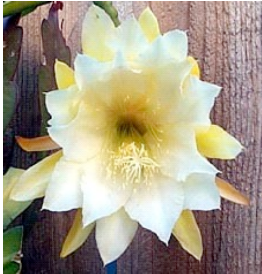
Epiphyllum 'Lemon Custard'

diately. Thicker leafed genera should be allowed to dry for a day or two before planting. Zygocactus can be easily propagated from cuttings, but for reasonable success, two segments need to be used rather than one.