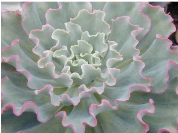
Echeveria 'Blue Curls'