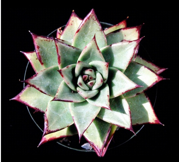
Echeveria agavoides cv 'Ebony'

Echeveria is one of the principal members of the succulent New World Crassulaceae . Echeveria come principally from the mountains of Eastern Mexico, although there are plants found from Texas into South America.