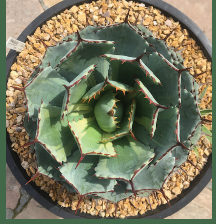
AGAVE HYBRID 'KISSO KAN' COLLIN O'CALLAGHAN