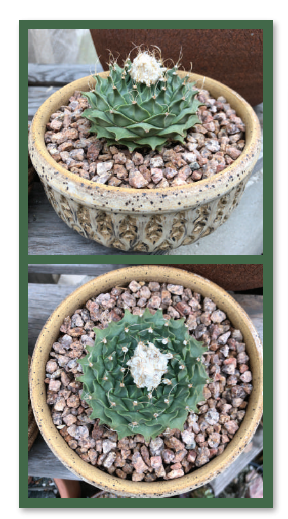
OBREGONIA DENEGRII