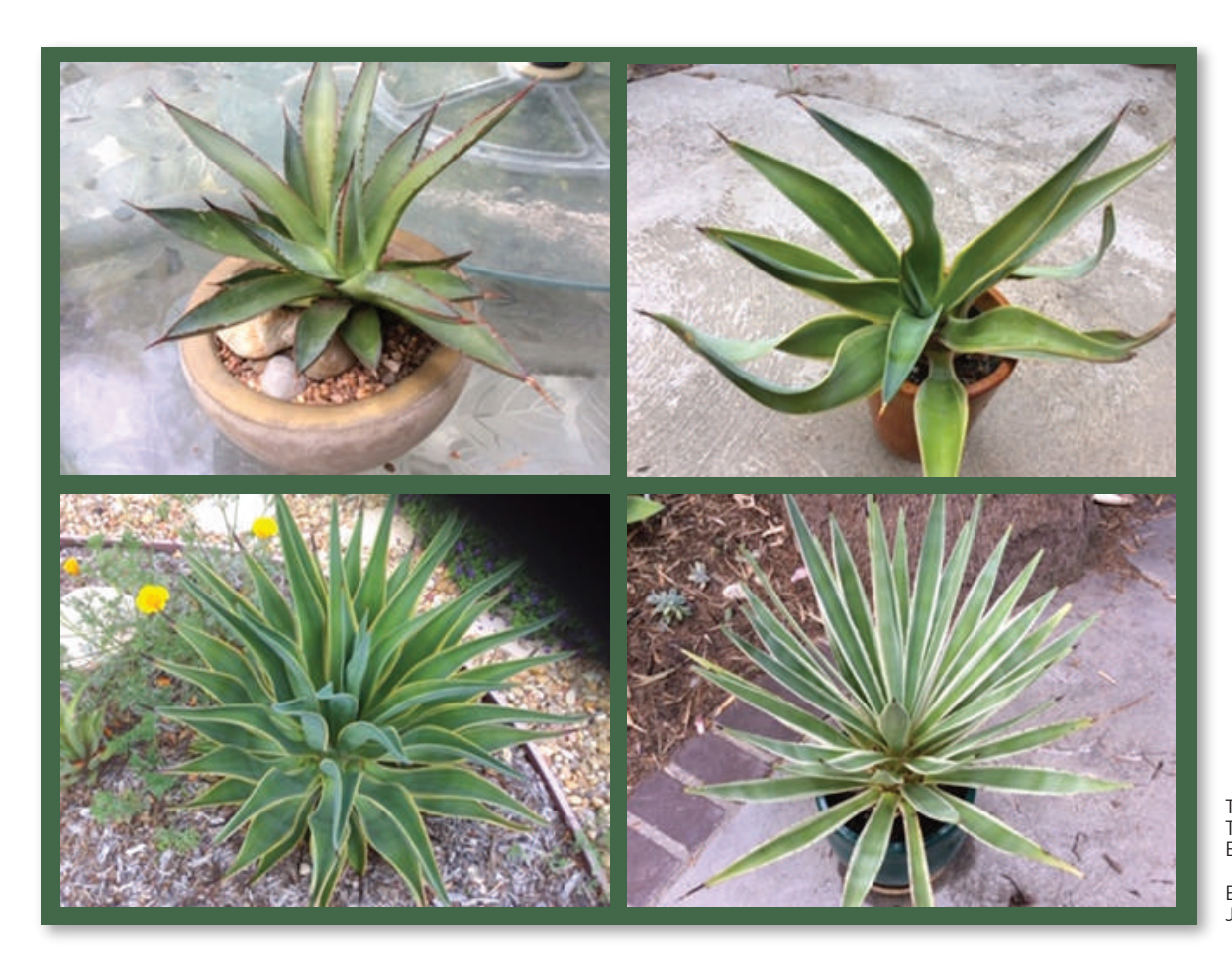
TOP LEFT: A. BLUE GLOW TOP RIGHT: A. DESMETTIANA BOTTOM LEFT: MOTHER OF AGAVE DESMETTIANA BOTTOM RIGHT: A. ANGUSTIFOLIO JENNIFER BENSI