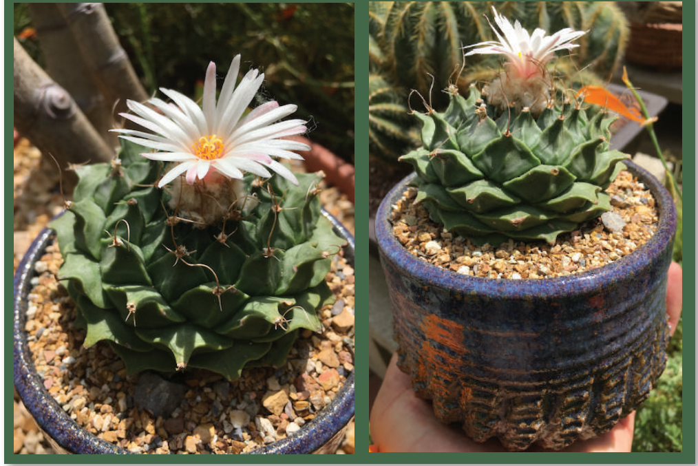
OBREGONIA DENEGRII COLLIN O'CALLAGHAN