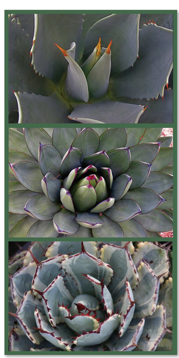
AGAVE HYBRID 'KICHIJOKAN' AGAVE HYBRID 'ROYAL SPINE' AGAVE HYBRID 'KISSO KAN'