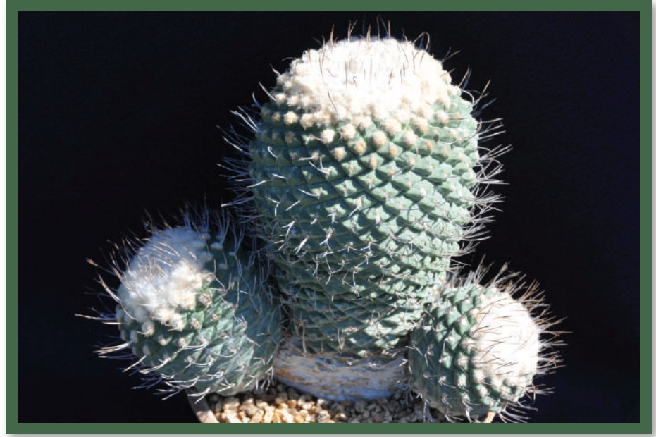
STROMBOCACTUS DISCIFORMIS DUKE + KAZ BENADOM