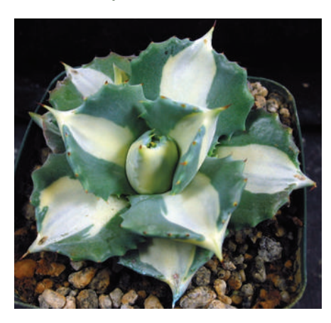
Agave isthmenensis 'Ohi Rajin'