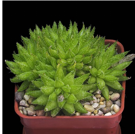
Haworthia reticulata v. reticulata

Also found in South Africa, is Haworthia reticulata , a species which has a number of subspecies associated with it. Haworthia reticulata is a liberally clustering plant that will turn reddish-bronze color in bright light.