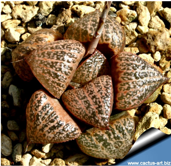
Haworthia magnifica v. splendons

Haworthia magnifica v. splendons like the previous species found in South Africa. This plant grows even to the ground and its coloration helps to camouflage it from damage from insects and other potential predators.