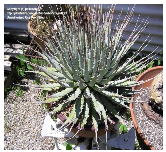
Agave utahensis v. nevadensis

The Yucca genus contains approximately 40 species. The stiff leaves of the plant form large rosette which ultimately branch. Yucca plants typically produce woody trunks and many species branch and become tree-like. Flowers are white or cream and are organized on panicles (a cluster of flowers on a branch structure).