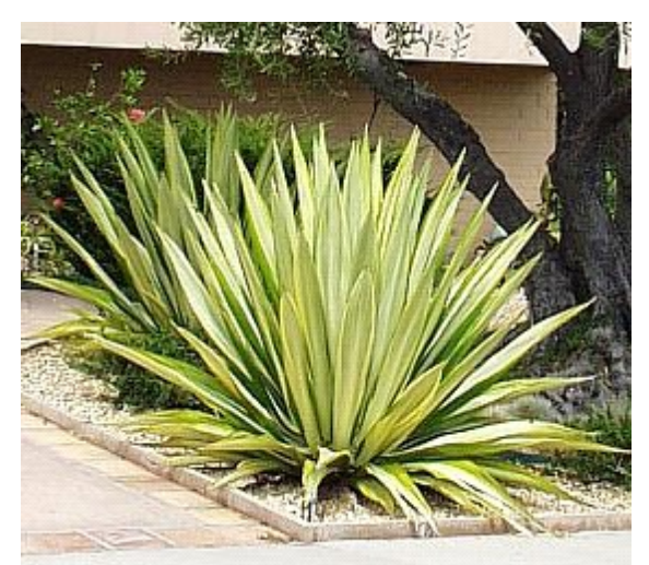
Furcraea foetida 'Mediopicta'