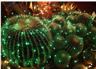
“359 best Southwestern Christmas images”