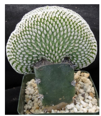
Turbinicarpus pseudopectinatus Crest

We are doing another combined plant of the month article this month because the subject isn't a particular kind plant, it is a cultivation technique used throughout the cultivated plant world, Grafting. Of course we are only interested in cacti and succulents for the plant of the month.