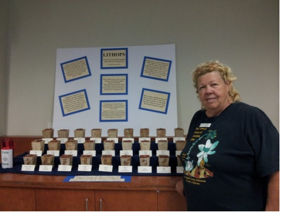
Sandy Chase – Lithops