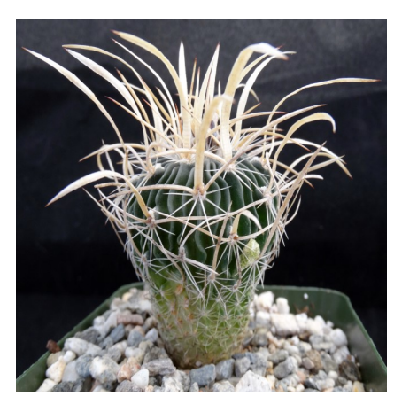
Stenocactus sp. 'Palmillas'

Stenocactus grow in grass lands, and need some protection from full sun. They are easy to grow, putting on most of their body weight each year in the early spring to summer. Plants growing outdoors will grow slowly during the winter using just the water from winter rains. It is important not to fertilize during the darker days of December, January or February, or etoliation or stretching of the body will occur. The narrow ribs, the wooly areoles, and the dense spines are an ideal habitat for mealy bugs. Frequent inspection of the plants will prevent them from spreading. Older plants sometimes get corky near the base. Keeping the plant in continuous growth delays this, but in some species the cork is inevitable.