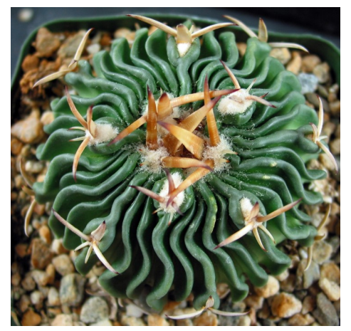
hundred years. The name Stenocactus seems to have finally triumphed. Echino traces to Echinus, which is Latin for Hedgehog, a spiny porcupine-like rodent from Europe, and also, equally likely, and much closer in appearance, a spiny, edible sea urchin from the Mediterranean. Stenos is Greek for narrow, an

obvious referral to the many narrow ribs on almost all of the species.