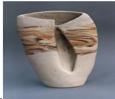
Early vessel made from mixed clays