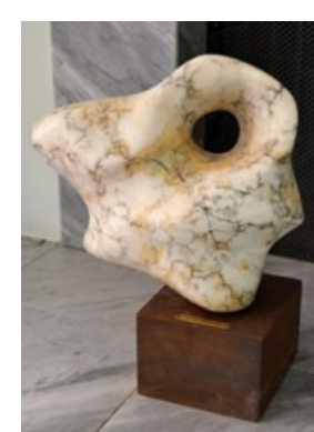
Early sculpture of carved marble