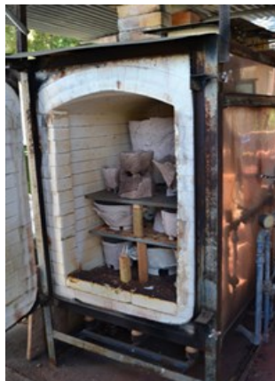
Getting ready for a show: Gas kiln filled with pots