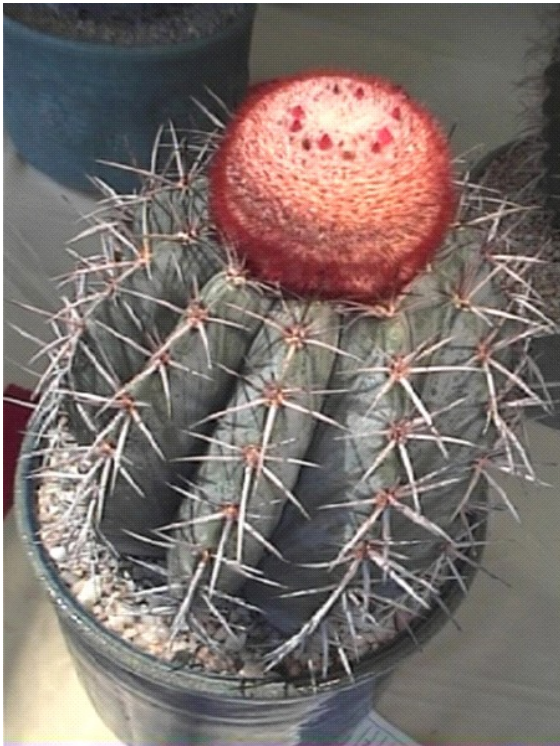
Melocactus azureus entered by Rosemarie Sauer in the 2003 CSSA Show

A Melocactus was very likely the first cactus seen by a European explorer, and certainly one of the first to be brought back and successfully grown. They were known in English collections by the late 16th century, less than 60 years after Columbus' first voyage.