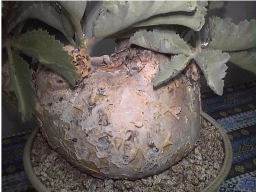
Cyphostemma seitziana entered in the 2001 Intercity Show by Petra Crist

Both Cissus and Cyphostemma plants are members of the Vitaceae or grape family. The members of this genus span the range of extremely easy to grow plants to real challenges. Most of the species will grow large, given time, good root room, lots of fertilizer, and water during the growing season.