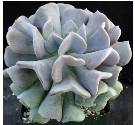
Echeveria 'Cubic Frost'

For the most, part the genus consists of stemless or short stemmed rosette forming succulents with thick fleshy leaves. It is closely related to Crassula , Kalanchoe , Cotyledon , Tylecodon , Sedum , Aeonium , and Dudleya . Echeveria most closely resemble Aeonium , Dudleya & Sempervivum . There are technical characters that distinguish each species, but for the average person there are some basic differences that can help. Sempervivum rosettes die after they flower, Echeveria do not. Aeonium usually has woody stems while the few Echeveria that do form stems tend to have fleshy ones. Dudleya and Aeonium are winter growers while Echeveria grows best in the warmer months. None of these genera grow together in the wild, so it is only in cultivation that telling them apart is an issue.