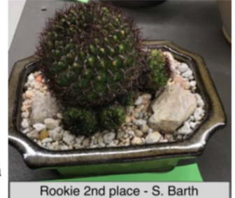
Rookie 2nd place - S. Barth

Rookies may enter newly purchased plants. Novice entrants must have owned their plants for at least 6 months. Advanced & Open/Masters entrants must have owned their plants for at least 1 year.