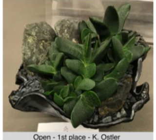
Open - 1st place - K. Ostler