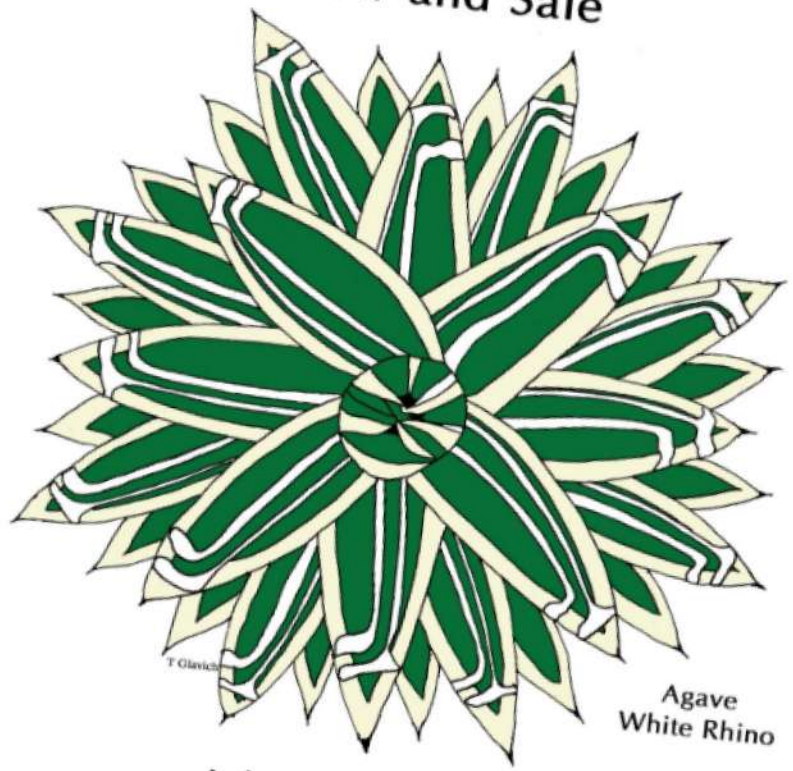
Agave White Rhino