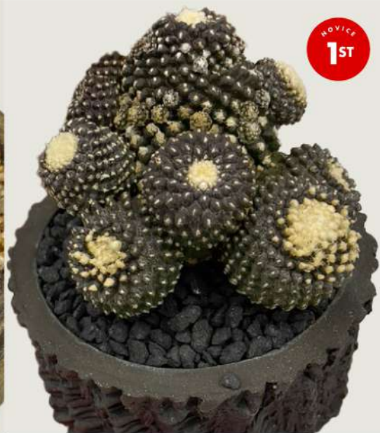
COLLIN O'CALLAGHAN COPIAPOA TENUISSIMA MONSTROSE