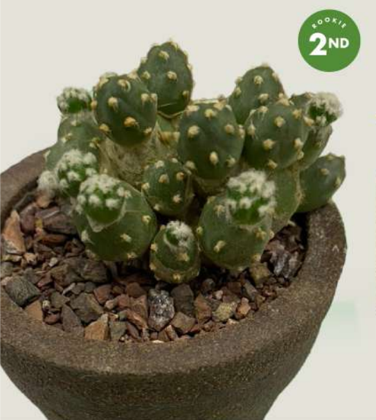
TEPHROCACTUS PENTLANDII