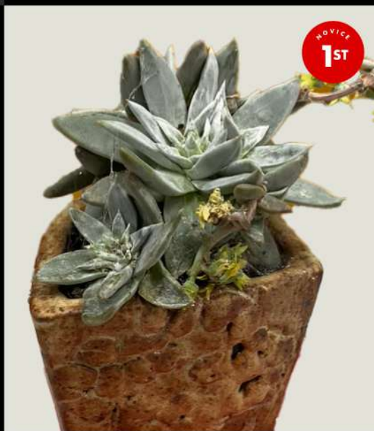
BONNIE IKEMURA DUDLEY GNOMA