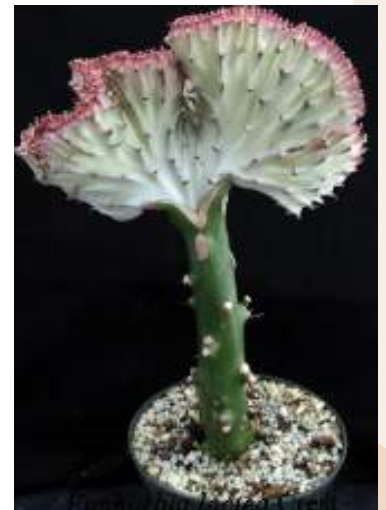
Euphorbia lactea crest

Step three is to physically graft the plants. Do this during the spring and summer as dormant or semi-dormant plants will not work. Detailed instructions of how to do the graft are beyond the scope of this article. But in short, you need to cut the top off the rootstock, cut the base off the scion then stick the two cut surfaces together. Pressure needs to be applied for a few days to a week, after which if the graft was successful the vascular systems of the plants have fused together and the top will start growing. If it fails you'll know pretty quickly because the scion will shrivel and fall off. It takes practice and even experts don't get 100% success.