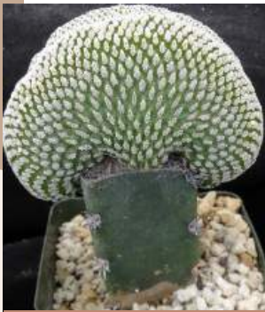
Turbinicarpus pseudopectinatus crest

Grafting is the process of taking two or more varieties of related plants and physically combining them into a single functioning plant. Usually, the idea is to put a slow growing or difficult to grow plant on top of an easy, fast growing plant. Why would anyone besides Dr. Frankenstein want to do this? Because grafted plants are almost always easier and faster growing than the desirable plant would be on its own roots. In fact, in certain cases it is literally impossible to grow some plants without grafting. Specifically, mutant plants lacking chlorophyll, such as "Moon Cacti" cannot manufacture their own food and require a rootstock to supply it.