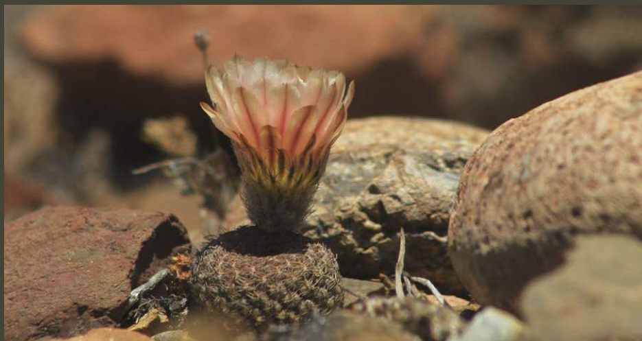
Eriosyce napina subsp. lembckeii . A little cactus of Atacama Region that is a species in danger.