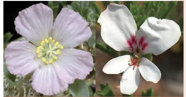
Comparison of Monsonia and Pelargonium flowers

This month we focus on Monsonia , the Bushman's Candles, a genus of small succulents and caudiciforms native to South Africa. They belong to the Geraniaceae, or Geranium Family, and are closely related to the better known Pelargonium . Monsonia differs from Pelargonium primarily in having "actinomorphic" flowers instead of zygomorphic ones. For the non-botanists out there, that means the flowers of Monsonia are more or less circular and you could divide them into two equal halves no matter where you draw the line (like a pie or cake). Zygomorphic flowers are symmetrical in one plane only, just like a person's face. There is only one direction you could divide the flower in two with equal halves.